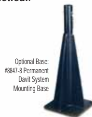
Optional Base: #8847-8 Permanent Davit System Mounting Base