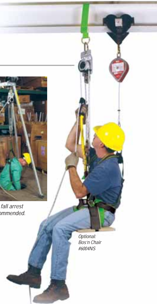
Optional: Bos'n Chair #6004NS