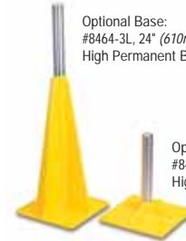
Optional Base: #8464-3, 3" (76mm) High Permanent Base