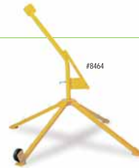
Optional Base: #8464-3L, 24" (610mm) High Permanent Base

Also available with permanent bases for mounting to truck beds or at confined space entrances while transporting the boom between locations.