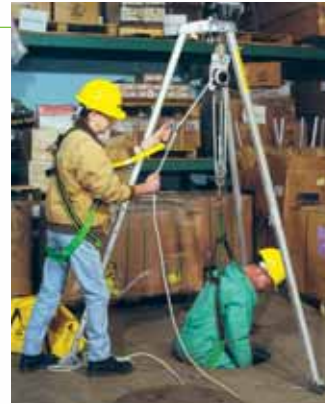
A secondary fall arrest system is recommended.