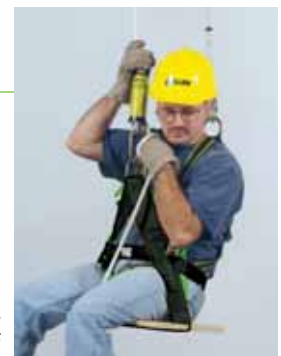
Optional: Bos'n Chair #6004NS

*Model 8113 Descent Device Unit must be ordered with Model 8195 polyester-braided rope (please specify length).